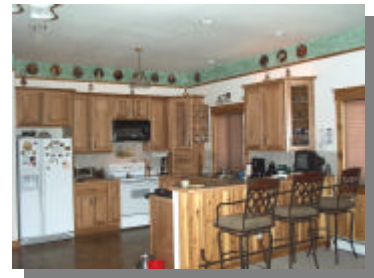
space to entertain!