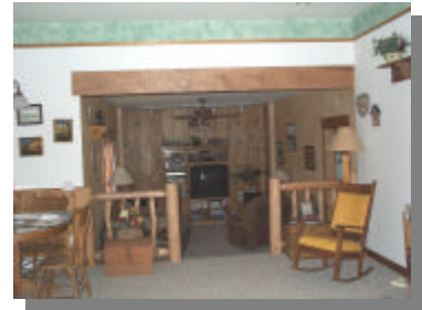
An open floor plan with