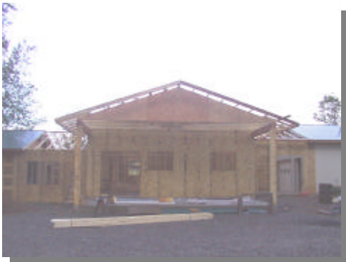
and adding a patio out front for comfortable outdoor seating and eating....