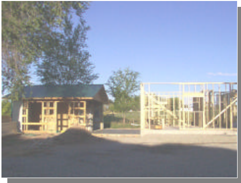
By converting a hay barn into an office,