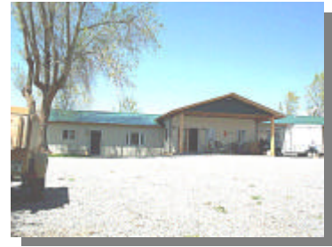
you get a nice home!