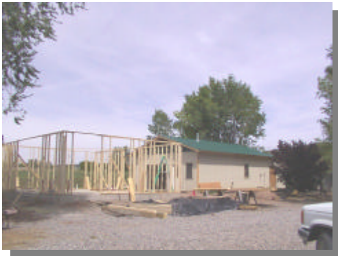
adding additional living space to connect to the existing shop,